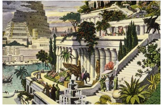
"Hanging Gardens of Babylon" by Martin Heemskerck (Dutch)