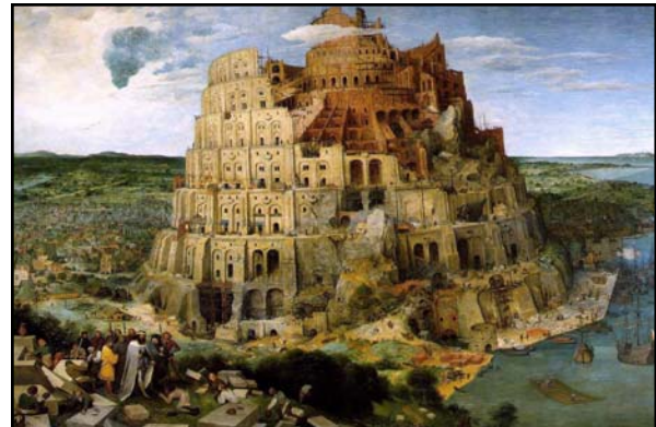
Mesopotamia – Tower of Babel