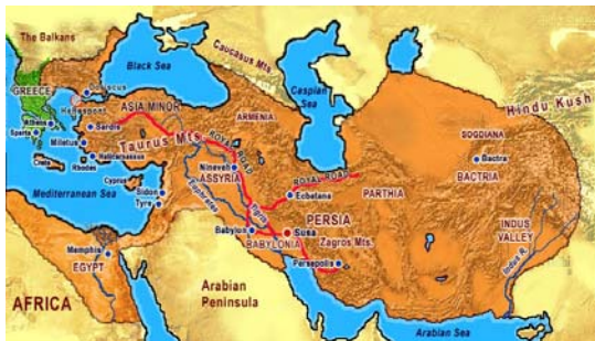
Intersections of Empires