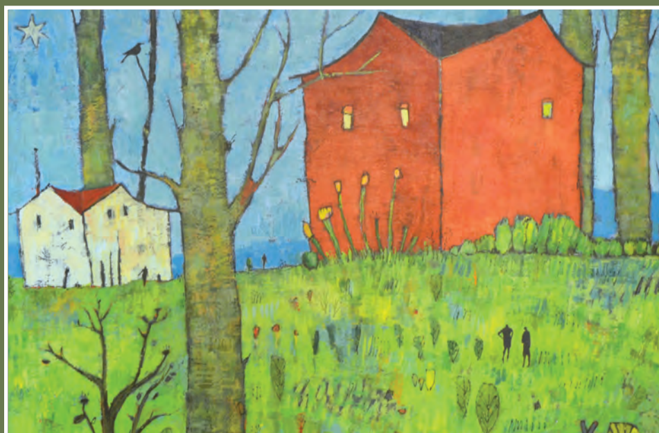
State Bar Art Collection/Jane Filer