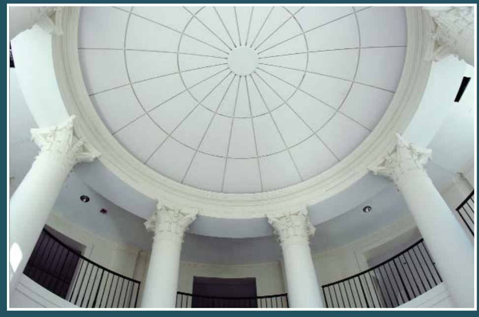
Rotunda, New State Bar Headquarters