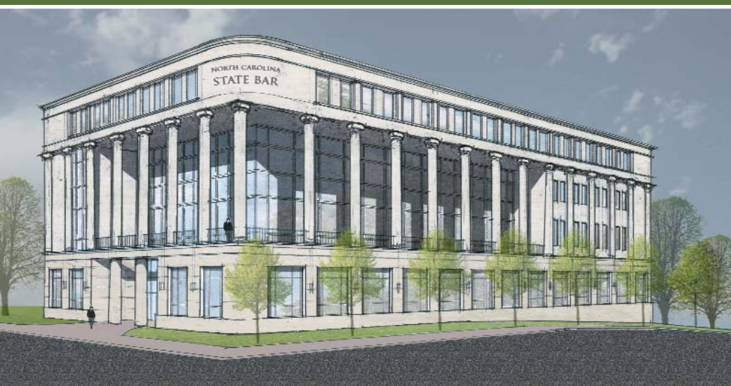
Architectural rendering of the proposed North Carolina State Bar Headquarters