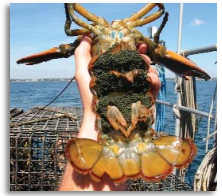
A previously v-notched lobster is recaptured carrying eggs. Note the piece missing from the left side of the tail.

We most frequently practice civility and