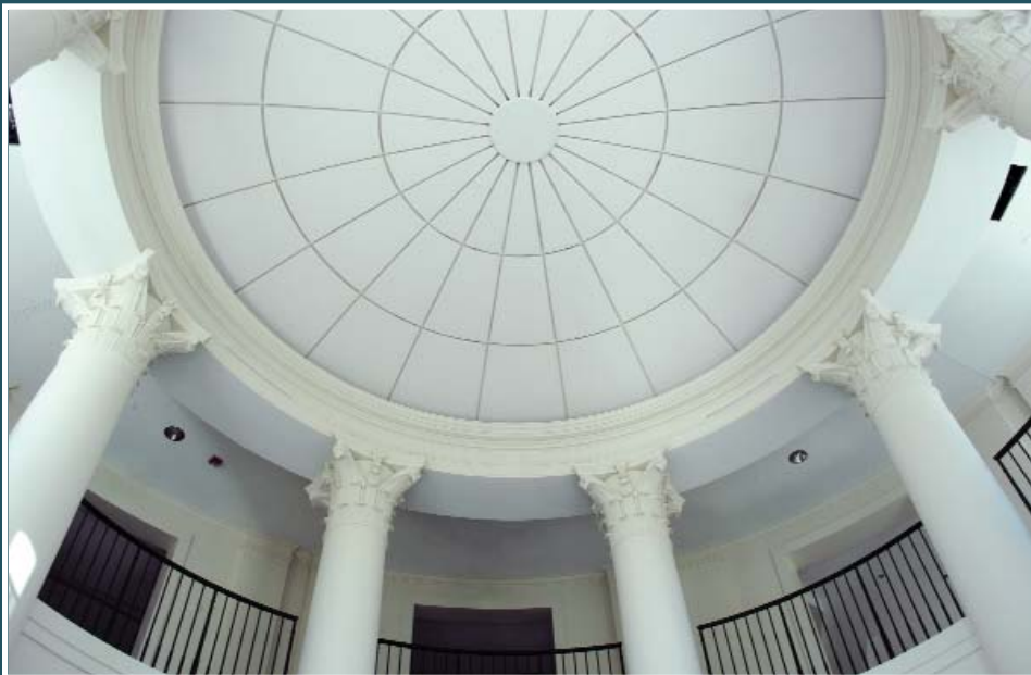
Rotunda, New State Bar Headquarters